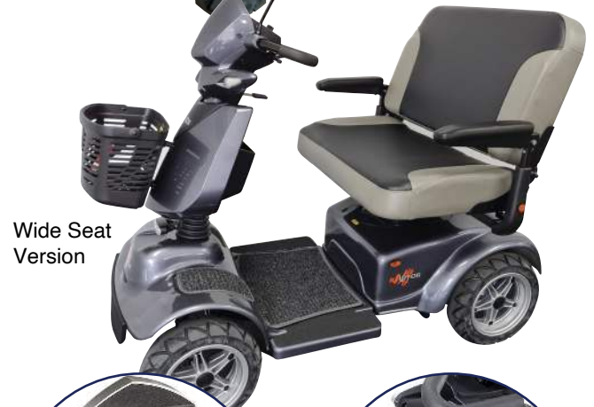
Wide Seat Version